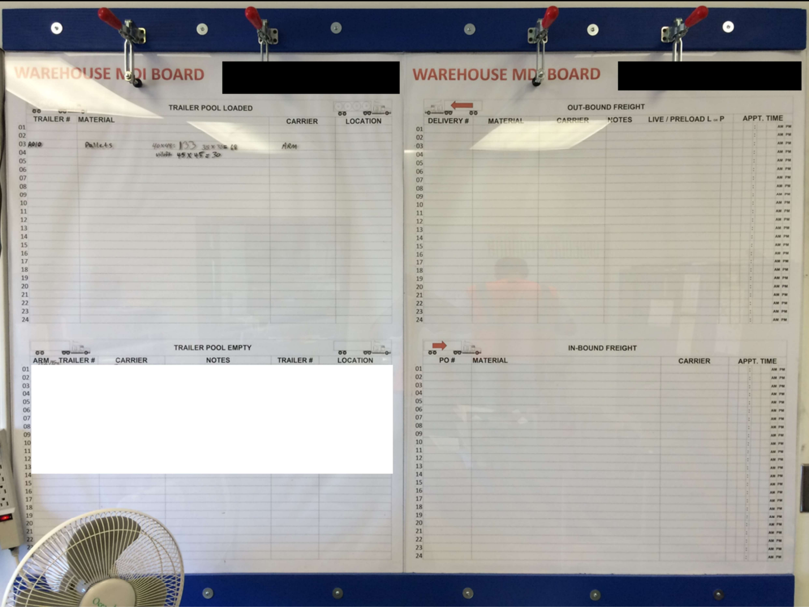
Inbound outbound scheduling visual display MDI boards. Staying with the old fashion air traffic control flight information strips the information of in-coming traffic is displayed on one MDI board and the out-going traffic is displayed on the other side posted to a time schedule.